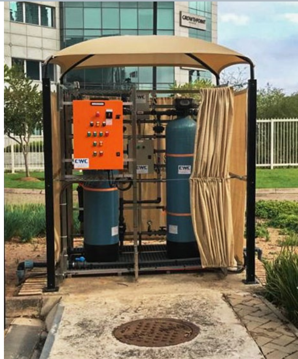
THE 2019 RESILIENCE GRANT HELPED PAY FOR THE INSTALLATION OF A NEW RAIN WATER SYSTEM FOR THE U.S. CONSULATE GENERAL JOHANNESBURG'S GARDENS.

Devastating droughts in South Africa in 2018 led to rapidly dwindling water supplies in Cape Town. The U.S. Consulate General got to work by installing a treatment plant on the facility boreholes and rainwater harvesting tanks, bringing in experts to advise the local government, and reducing use of municipal water consumption by 70 percent. The U.S. Consulate General in Johannesburg also depended on a dwindling municipal water supply to support its operations. In 2020, the Consulate General won a Resilience Innovation Grant, funded by OBO via the GDI Awards, to install a rainwater recovery and treatment system to increase resilience and reduce its impact on the local infrastructure. CG Cape Town is also designated by the National Wildlife Federation as a Certified Wildlife Habitat in recognition of its support for pollinators and other local wildlife.