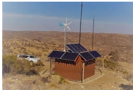
EMBASSY WINDHOEK'S SOLAR- AND WIND-POWERED RADIO REPEATER TOWER

U.S. Embassy Windhoek had frequent issues with emergency radio broadcasts because of power fluctuations to radio repeaters. To solve the problem and ensure the radio would be available in a life-or-death situation, the Embassy turned towards green solutions. They installed a wind turbine and solar panels on the radio repeaters, ensuring constant power to the site. They also incorporated a Global System for Mobile (GSM) communications control solution for repeater tower operations, meaning personnel could perform basic maintenance tasks remotely. Not only was the green solution the cheapest solution with no associated monthly costs, but removing the need for weekly maintenance trips saves Embassy Windhoek and the Department time and money while reducing their overall carbon footprints.